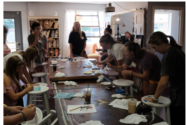
Debs concentrate on decorating stools at the Paint Your Perch party. This traditional event is held in preparation for the December 28 Presentation Ball.